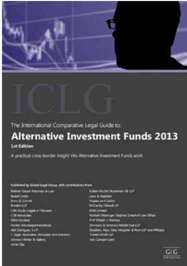
International Comparative Legal Guides (ICLG) Alternative Investment Funds 2013 Bermuda Chapter Published: 15/05/2013 ISBN: 978-1-908070-63-0