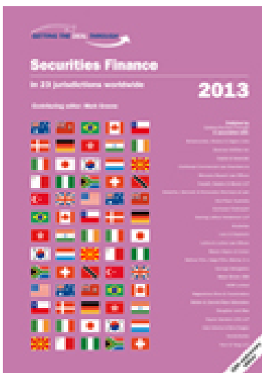
Getting the Deal Through Securities Finance 2013 Bermuda Chapter Published: 04/2013 ISSN: 1744-0939