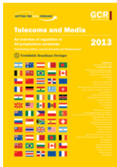
Getting the Deal Through Telecoms and Media 2013 Bermuda Chapter Published: 03/2013 ISSN: 1471-0447