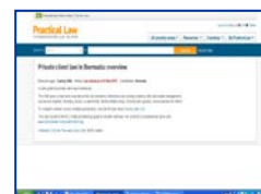
PLC Multijurisdictional Guide [2013] Private client law in Bermuda: overview (online)

Also: PLC Multijurisdictional Guide [2013] Lending and taking security in Bermuda: overview (online)