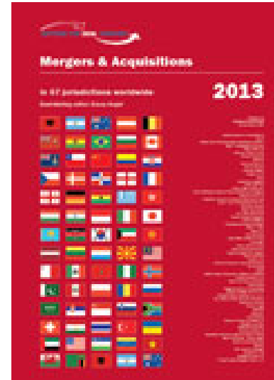
Getting the Deal Through Mergers & Acquisitions 2013 Bermuda Chapter Published: 21/05/2013 ISSN: 1471-1230